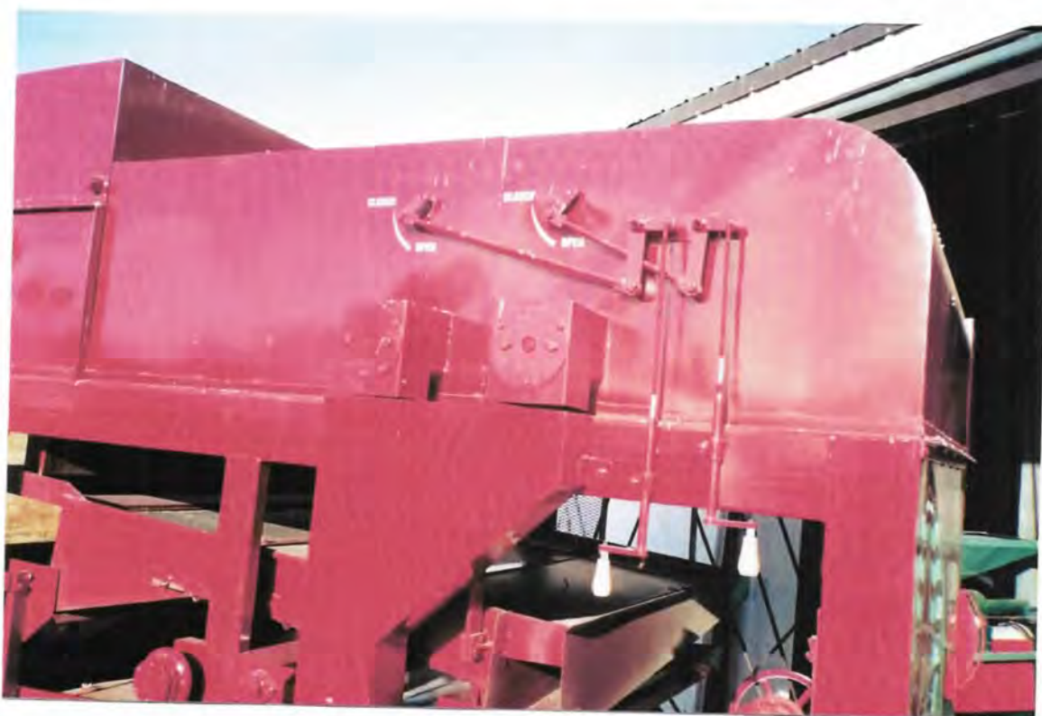
Pictures of the final air velocity gate, grain transport pan and adjustment handle, on page 8.

Once the air is set on the unit, you can increase or decrease the velocity of the air on the final air by moving the slide on the back wall of the final air chamber, just above and behind the bottom shoe grain transport pan. The adjustment is located on the back left hand side of the unit. By having the slide in the most lower position it will give the final air the most velocity. By raising the slide it will give the final air less velocity , but more volume.